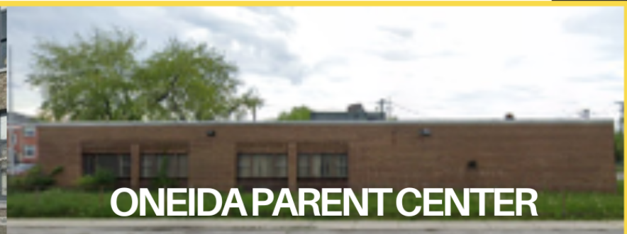
ONEIDA PARENT CENTER